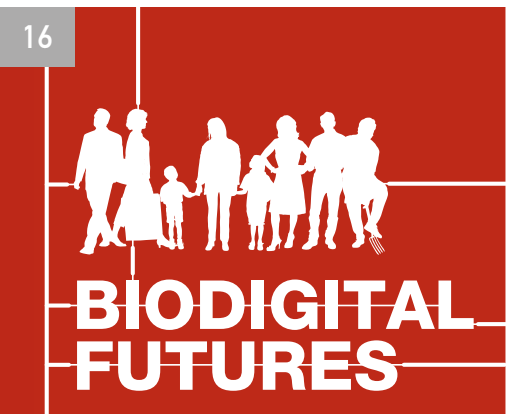
16 The Social Science of the Genome