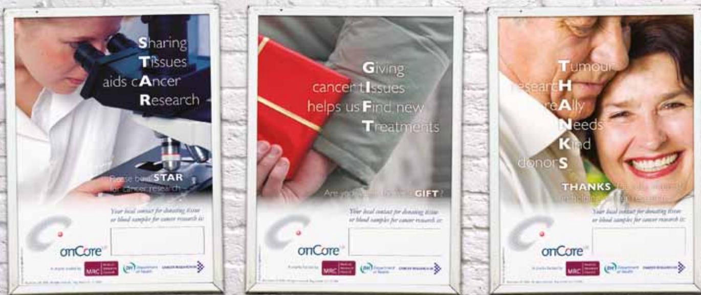
Fig 1: onCore UK promotional posters

Then, in October 2010, the day before the coalition government’s Comprehensive Spending Review, the Board of Trustees made another announcement stating that, while a sub-section of the advisory activities of onCore UK should continue, they should be conducted by other organisations under the National Cancer Research Institute (NCRI) umbrella.