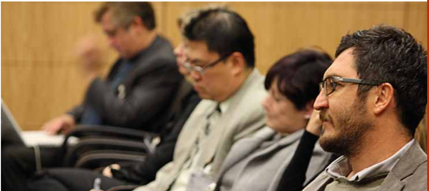
Delegates at the Genomics Network/ OECD conference

The ESRC Genomics Network has been running unified network conferences every year since 2007 but the meeting for 2010 was rather different. It was targeted at a policy audience and was co-hosted at the OECD headquarters in a stately quarter of Paris. The attendees were composed in almost equal parts of academics and people from the worlds of policy.