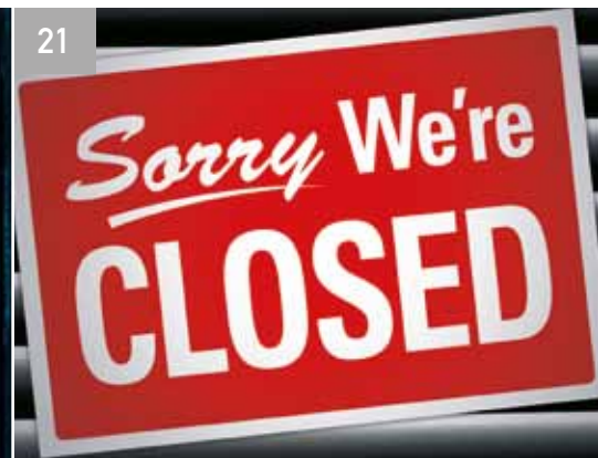
21 The £4m Cancer Tissue Bank that Closed