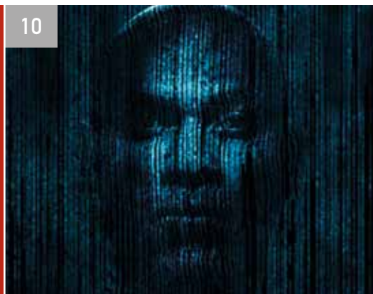
10 Human Face of Data-Intensive Biology