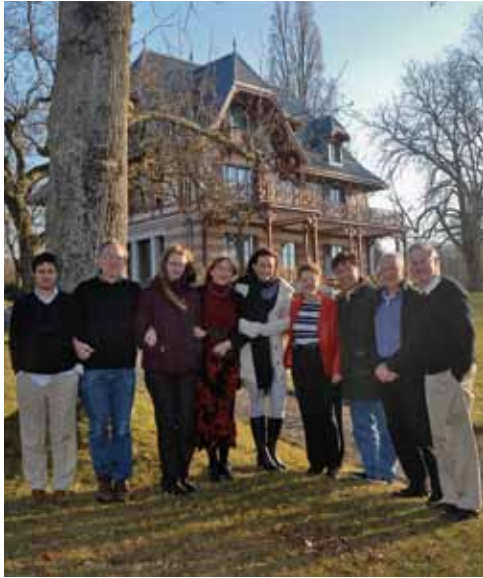
The working group outside the Brocher Foundation, Geneva